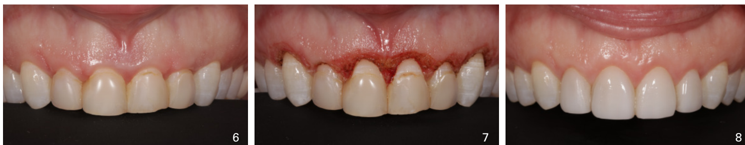
Fig. 6. Healing at 8 weeks. The buccal contour has smoother transition and flatter profile. Notice slight gingival recession over the existing restorations even without gingival reduction. Fig. 7. Gingivectomy with Diode LASER to recontour the gingival margin to exposure anatomical CEJs. Fig 8. 2 years follow up with final restorations. Gingival tissues are in harmony with restorations without any signs of irritation or inflammation.