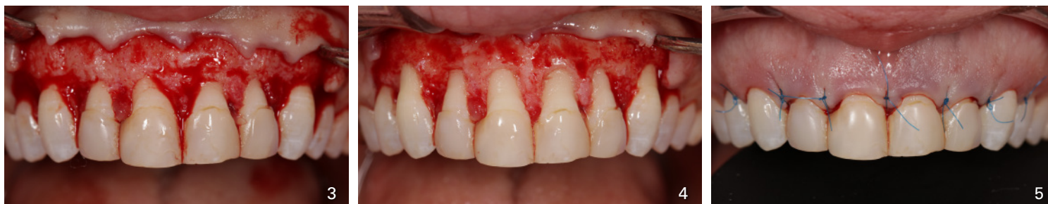
Fig. 3. After gingival flap, buccal bone was noted in close proximity to the CEJs. Discrepancies between the margins of the existing restorations and anatomical CEJs were noted. Fig 4. Osteoplasty and ostectomy were performed to keep buccal bone at least 3 mm away from the anatomical CEJs which will be the margins of future final restorations. Thick buccal bone was also reduced. Fig 5. Flap was closed with sutures in a simple interrupted fashion. No gingival reduction was done at this stage of the surgery.