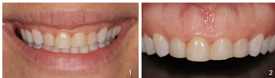
Fig. 1. Patient presented with worn-out teeth and uneven gingival margin on maxillary anterior teeth. She expressed she wants to fix her smile and showing less gingiva. Fig. 2. Retracted view shows robust and thick gingival phenotype and buccal bone.