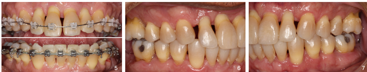
Fig. 5. Six month post perio surg and bone regeneration ortho was commenced Fig. 6-7. Post ortho and perio, ideal occlusion is established. Note gingival health, tissue is firm, pink and stippled.