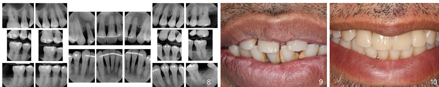
Fig. 8. FMX 5 years post op (compare to Fig 2). Bone is regenerated and stable. Fig. 9. Smile pre op with poor esthetics. Fig. 10. Smile post op. Excellent health orally and systemically as diabetes is now under control, and self-esteem is improved.