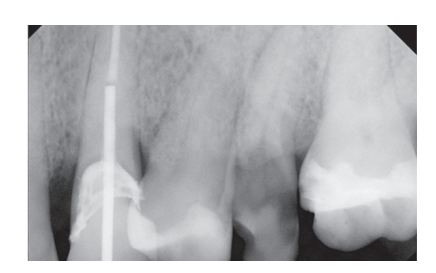
Pre-op radiograph confirms clinical diagnosis