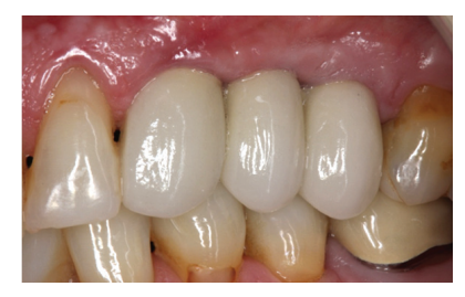
Seven months following implant placement, definitive implant-supported restoration in place