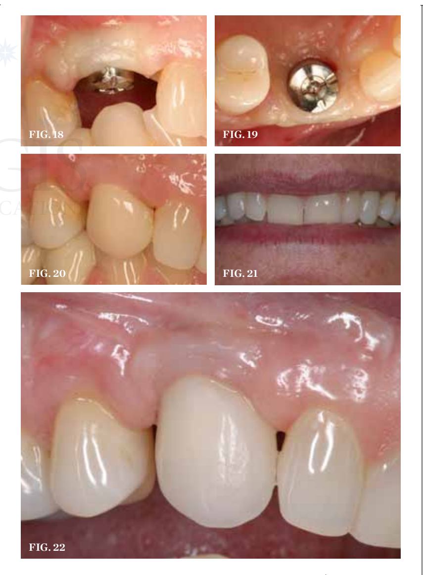
CASE PRESENTATION (18.) Placement of 4-mm tall CAD/CAM healing abutment to facilitate final impression. (19.) Acceptable buccal-lingual positioning of the implant may be appreciated from this occlusal view of the new healing abutment. (20.) Temporary prosthesis for No. 6 in place 3 weeks after final impression. (21.) Smile view of the final No. 6 crown in place. (22.) Buccal view of the final No. 6 crown. Papillary discrepancy remains on the mesial and distal; these spaces may fill with tissue as time passes.

preliminary results of use in the preparation of future sites for implants. Int J Oral Maxillofac Implants . 1999;14(4):529-535.