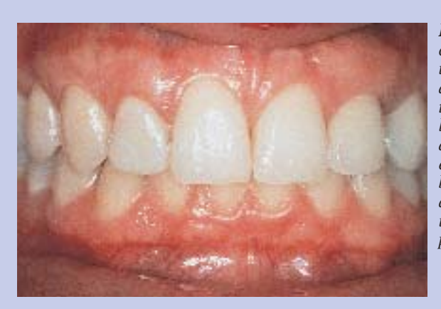
Figure 2U—Intraoral view of completed restoration. To the untrained eye, tooth No. 12 appears to be a canine, and tooth No. 11 appears to be a lateral. Note the improved dentogingival relationships established through the combination of gingival grafting and selective crown lengthening and gingivectomy. Compare to Figure 2B.