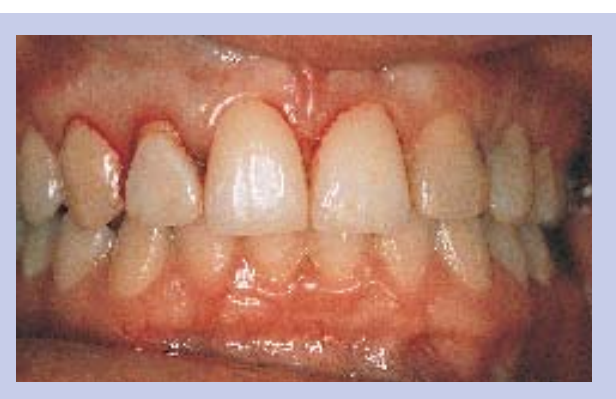
Figure 20—Six weeks after stage-one crown lengthening, the patient was scheduled for second-stage surgery—a gingivectomy on the labial surface of teeth Nos. 7 and 11. Slight gingival reshaping was also performed on the mesial labial of tooth No. 9.

and 9 to place the gingival zenith of these teeth slightly distal to the midline (Figure 2K).