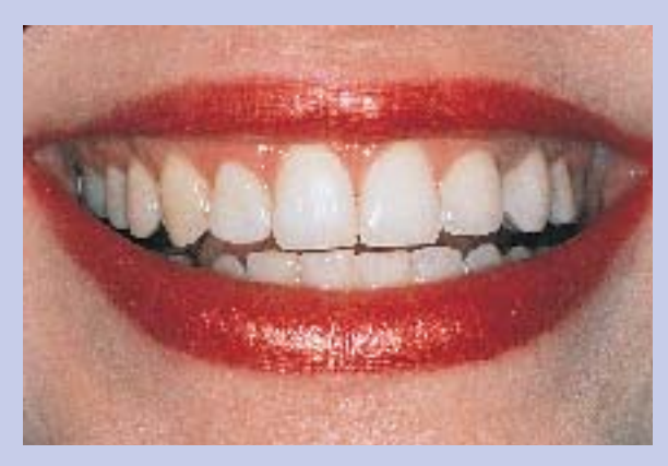
Figure 2V-Extraoral smile view shows gingival harmony and symmetry. Compare to Figures 2A and 2I. Patient is very pleased.

of her provisional restoration. The provisionals were not fabricated until the position of the dentogingival complex was established and stabilized. Periodontal surgery was performed precisely and under control in a step-by-step fashion. This led to a predictable result and a satisfied patient.