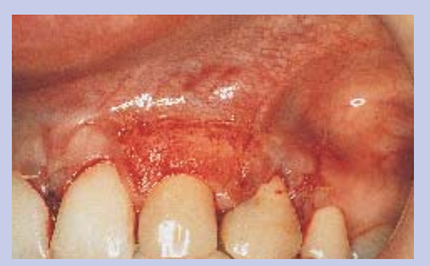
Figure 2M—The labial flap over tooth No. 12 is seen sutured after ostectomy. Note the reddened denuded tissue over tooth No. 11, which has just received a gingivoplasty.

the flap margin can change depending on the amount of recession and resolution of swelling.