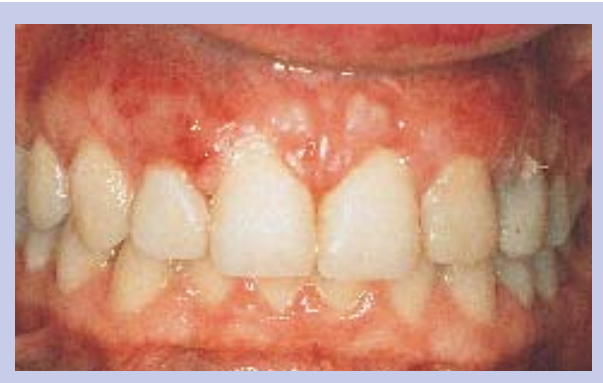
Figure 2N—One-week postoperative healing after stageone crown lengthening and dermabrasion. Healing is proceeding well.