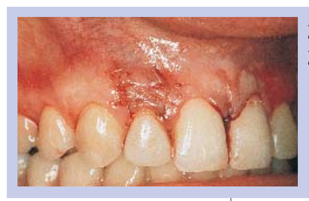
Figure 2L—The flap is sutured in place with (5-0) gut suture after ostectomy. An attempt is made to reposition tissue. Healing should be uneventful as a result of atraumatic handling of the tissues.