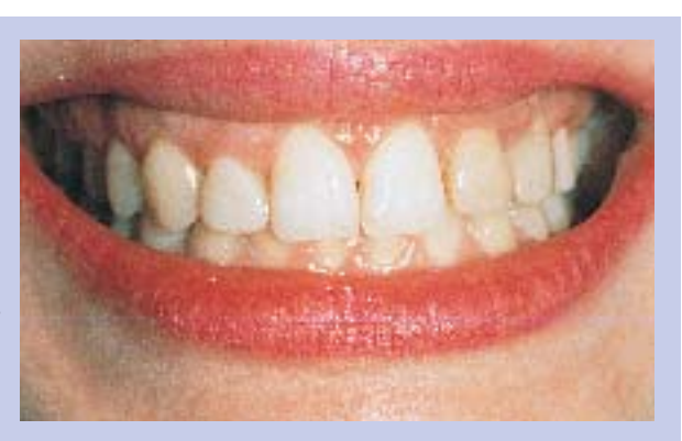
Figure 2I—Smile shot taken same day as Figure 2H. Note that gingiva is positioned more incisally on tooth No. 11. Compare to Figure 2A. However, teeth are still not symmetrical, and thickened tissue is seen over tooth No. 11.

When a combination of procedures is contemplated for an anterior reconstruction, the regenerative procedures are performed first because the final position of the free gingival margin with an SCTG cannot always be precisely determined. This allows the clinician to later modify the gingival margins with crown lengthening procedures to achieve a precise result. Also, although SCTGs have excellent success, individual patient variability can occasionally lead to a less-than-ideal result. Therefore, it is important to know what the potential for regeneration in this patient is before committing the patient to restoration and crown lengthening.