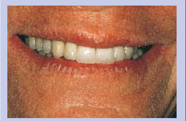
Figure 1D—Postoperative smile view reveals improved appearance. Teeth are in better balance, and more tooth structure is shown