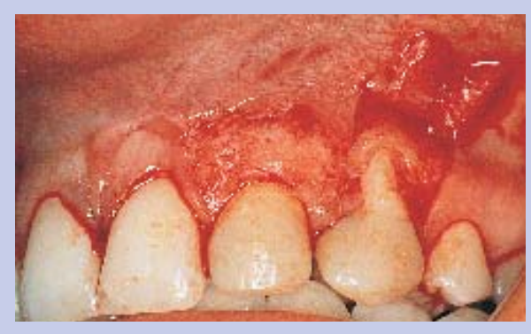
Figure 2J—Gingivoplasty was performed on tooth No. 11 to eliminate thickened tissue. Stage-one crown lengthening initiated on tooth No. 12. Note two vertical incisions at the mesial and distal labial line angles of tooth No. 12. Papillae are not touched. Only labial ostectomy is performed on this day.