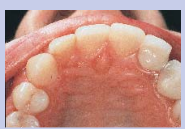
Figure 2T—Occlusal view of completed restoration. Note how the all-ceramic crowns on teeth Nos. 11 and 12 attempt to mimic teeth Nos. 10 and 11.