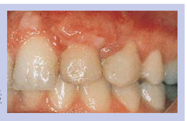
Figure 2G—Two-week postoperative healing of SCTG. Healing is excellent, and root coverage is anticipated. Improved dentogingival relationship is already evident.

required both regeneration and reduction of gingival tissues.