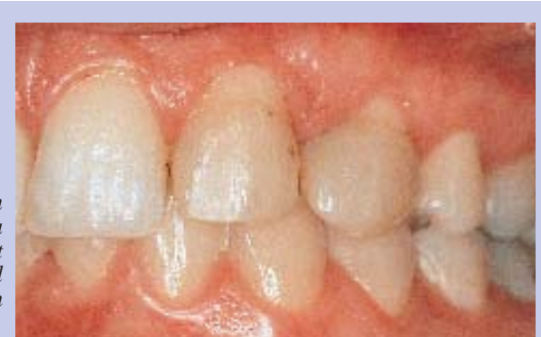
Figure 2E—Left lateral preoperative view shows canine in lateral position. Note minimal band of attached gingiva about canine. Dentogingival junction canine is apical to that of the central and adjacent premolar, giving an unbalanced appearance. Note the restoration in cervical third of tooth No. 11, which must be removed before gingival grafting.