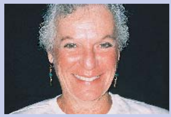
Figure 1F—Postoperative facial view. Esthetic appearance is greatly improved. Patient appears happier and more confident.

"lateral incisors," teeth Nos. 7 and 11. Tooth No. 7 was too short in an incisal apical dimension, and tooth No. 11 was too long incisal apically.