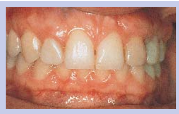
Figure 2H—Two-month postoperative healing of SCTG of tooth No. 11. Root coverage was successful. However, tissue is bulbous and crown lengthening is still indicated for teeth Nos. 7 and 12.