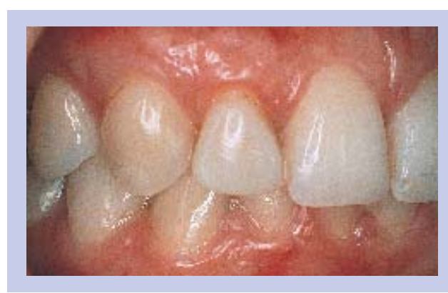
Figure 2P—Right side 2-month postgingivectomy healing is complete. Note the CEJ is now exposed on tooth No. 7. However, the gingival labial position is in harmony with teeth Nos. 6 and 8.