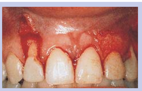
Figure 2K—Stage one of two-stage crown lengthening being performed on tooth No. 7. Ostectomy has just been completed. Two vertical incisions were made at the labial line angle to allow access to the labial bone of tooth No. 7. The anticipated free gingival labial margin of tooth No. 7 will be 3 mm from the crest of bone. A slight gingivectomy was also performed on the labial of teeth Nos. 8 and 9 to improve esthetics.

The patient was instructed to rinse with Peridex ® ( Zila, Inc. ) mouthwash for 4 weeks and suspend all mechanical oral hygiene over the grafted area for 4 weeks. She was also placed on a soft diet for 2 weeks. The patient was seen weekly for follow-up care.