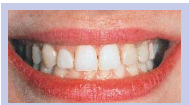
Figure 2A—Initial presentation of patient's smile. The "laterals" and "canines" are asymmetrical. Labial gingiva is seen apical to tooth No. 7 but not to tooth No. 11 (in the lateral position). Discoloration is also evident. Smile is not balanced

Tooth No. 7 was almost a peg lateral; therefore, it was too short incisal apically. The distance between its gingival margin and the adjacent central incisor was almost 4 mm (Figure 2D). Compared to its contralateral lateral tooth (No. 11), it was significantly shorter. This was also because tooth No. 11 was too long incisal apically to be a normal-looking lateral incisor. In fact, the gingival margin of tooth No. 11 was apical to the central incisors (Figure 2E).