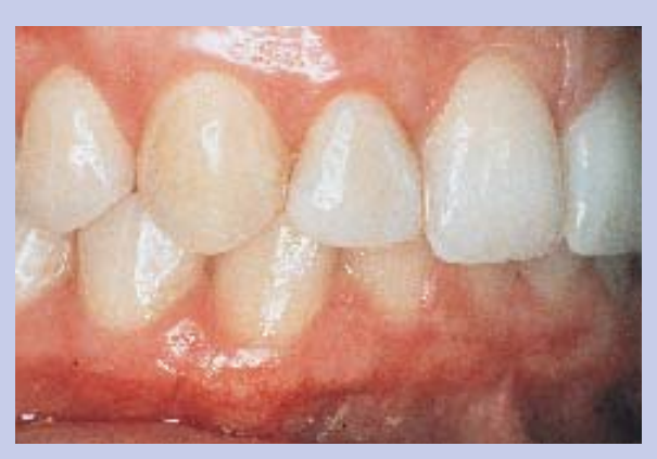
Figure 2R—Right side final restoration. The harmony between teeth is excellent. Tooth No. 7 received a bonded restoration. Compare to Figure 2D. (Restorative dentistry courtesy of Dr. Jon Chadys, Monroe, Conn.)