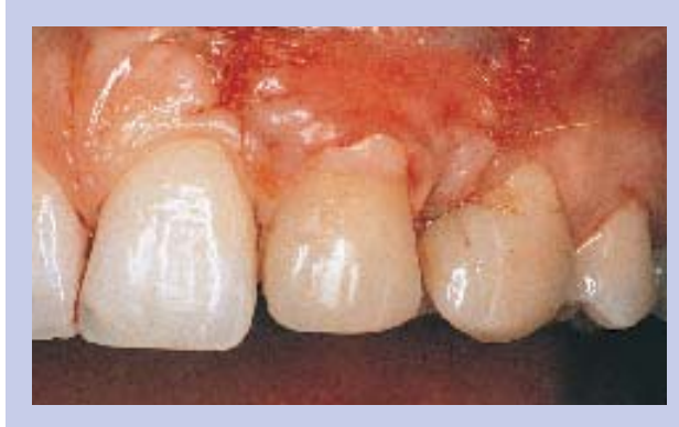
Figure 2F—SCTG has just been completed. Root was treated with finishing burs and tetracycline. Note lack of bleeding and good tissue adaptation. Gingival margin has been repositioned incisally, which will lead to an increased amount of keratinized gingiva, as well as an improved esthetic result.