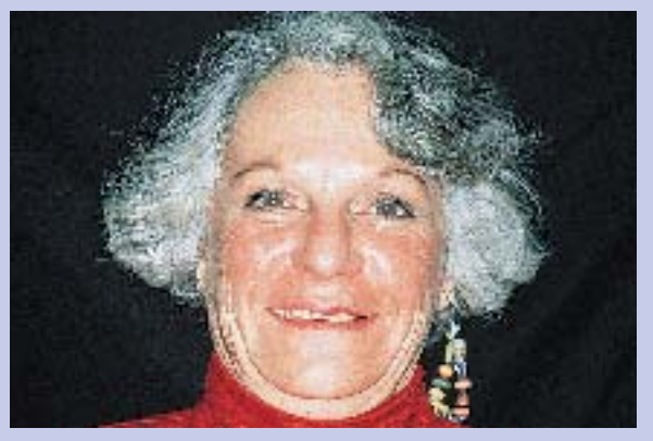
Figure 1E—Preoperative facial appearance before beginning dental reconstruction.