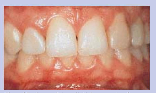
Figure 2B—Intraoral view of initial presentation shows peg lateral (tooth No. 7) and asymmetry between laterals and canines. Gingival labial profile is not harmonious. Contralateral teeth are of different incisal apical lengths.