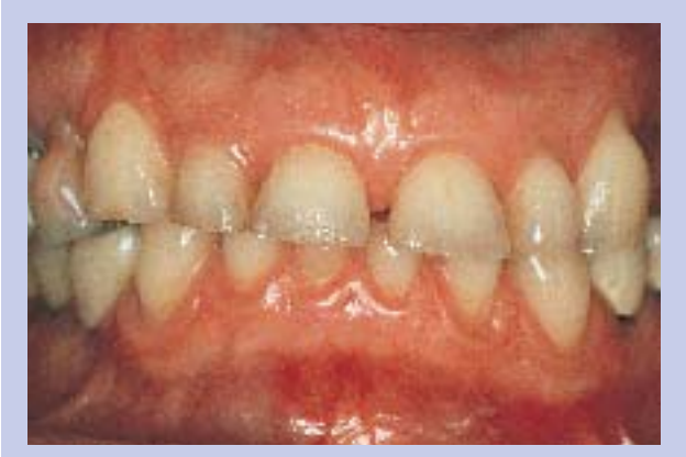
Figure 1A—Intraoral preoperative view reveals many alterations in ideal dental and dentogingival relationships. Anterior flaring, diastemas alterations in dentogingival heights, and teeth discolorations are evident.