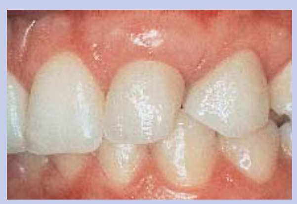
Figure 2S—Left side final restoration. Full-coverage, all-ceramic crowns are present on teeth Nos. 11 and 12. Crowns give the illusion of teeth in their normal position. Note the newly established healthy gingival position on tooth No. 11. Compare to Figure 2E.