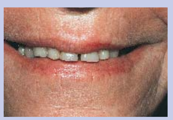
Figure 1B—Smile view shows minimal display of teeth as a result of tooth wear and decreased vertical dimension.