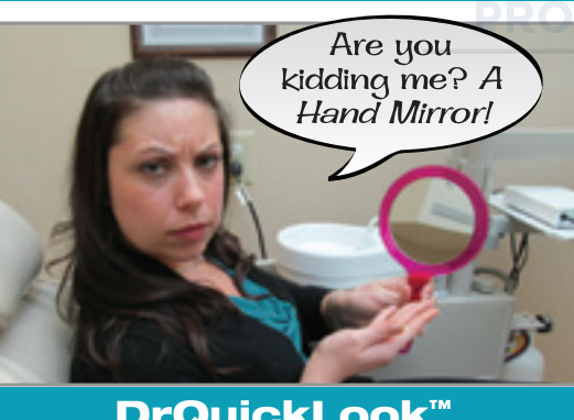
DrQuickLook™ Makes far more sense than a hand mirror!