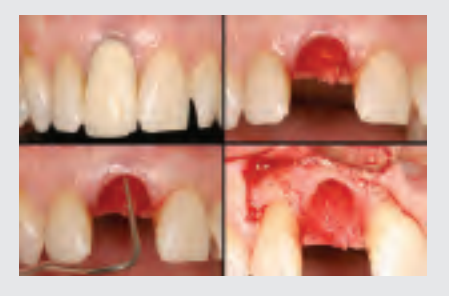
Figure 6 —A: Hopeless tooth No. 8. B: Atraumatic extraction executed. C: Probing reveals thin buccal plate. D: Vertical incision placed at distal line angle of tooth distal to extraction site. Note termination of the incision is at a 90-degree angle to ease suturing. Tooth No. 8 mesial papilla raised with sulcular extension on buccal to improve visualization.