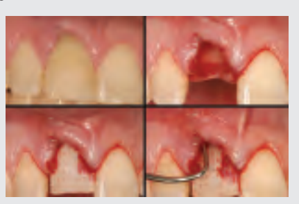
Figure 9 —A: Tooth No. 8 exhibits fracture. B: Atraumatic extraction performed. C: Collagen membrane placed at missing buccal plate region. D: Membrane adapted to mimic labial plate with a periodontal probe.